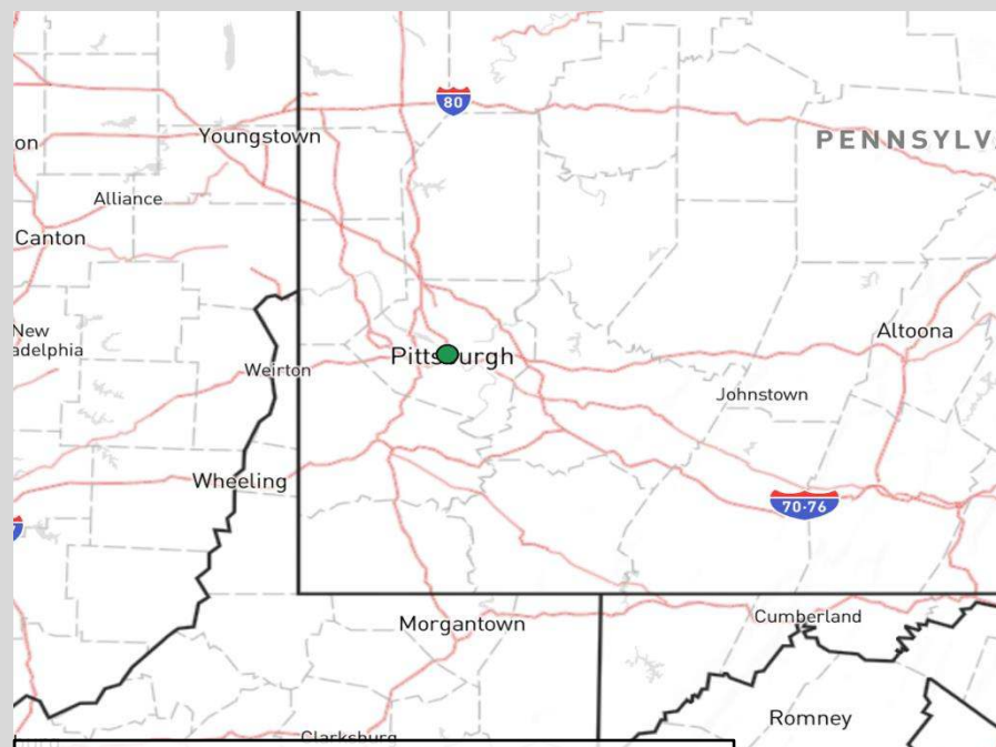
Current Radar 7:35 AM ET