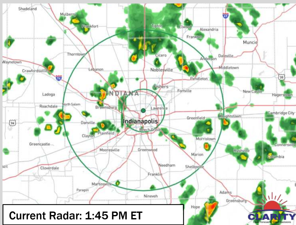
Current Radar: 1:45 PM ET