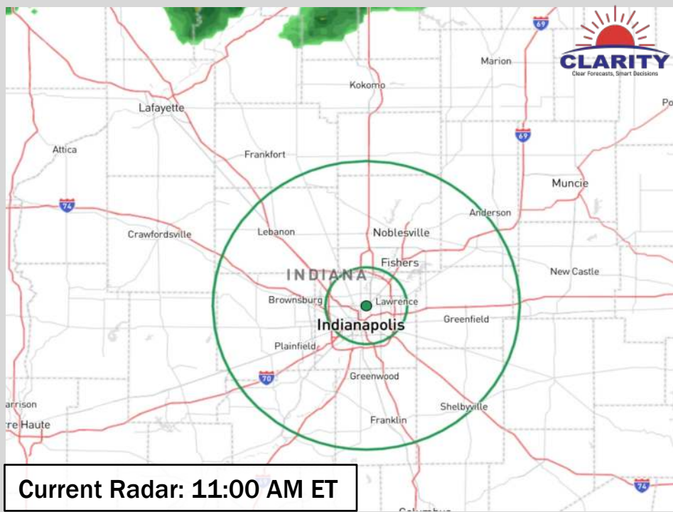
Current Radar: 11:00 AM ET