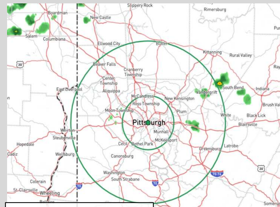
Current Radar 12:40 PM ET