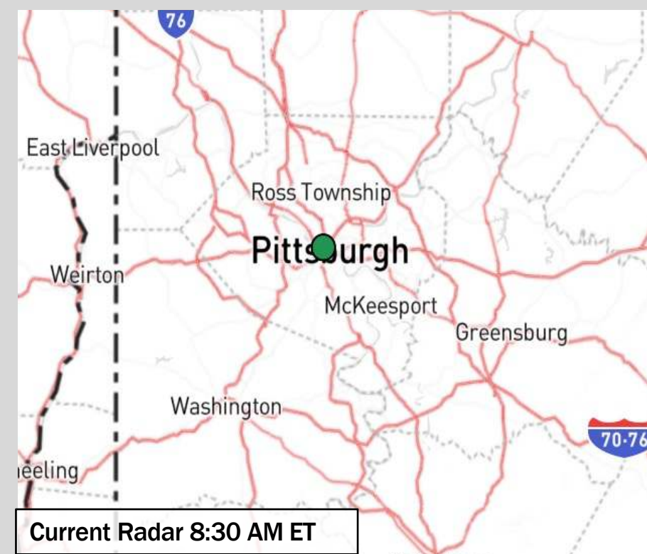
Current Radar 8:30 AM ET