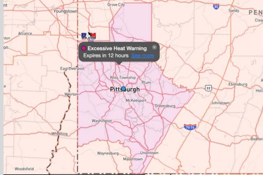
Current Radar 12:05 PM ET

Excessive Heat Warning (Ends SAT at 8:00 PM ET)