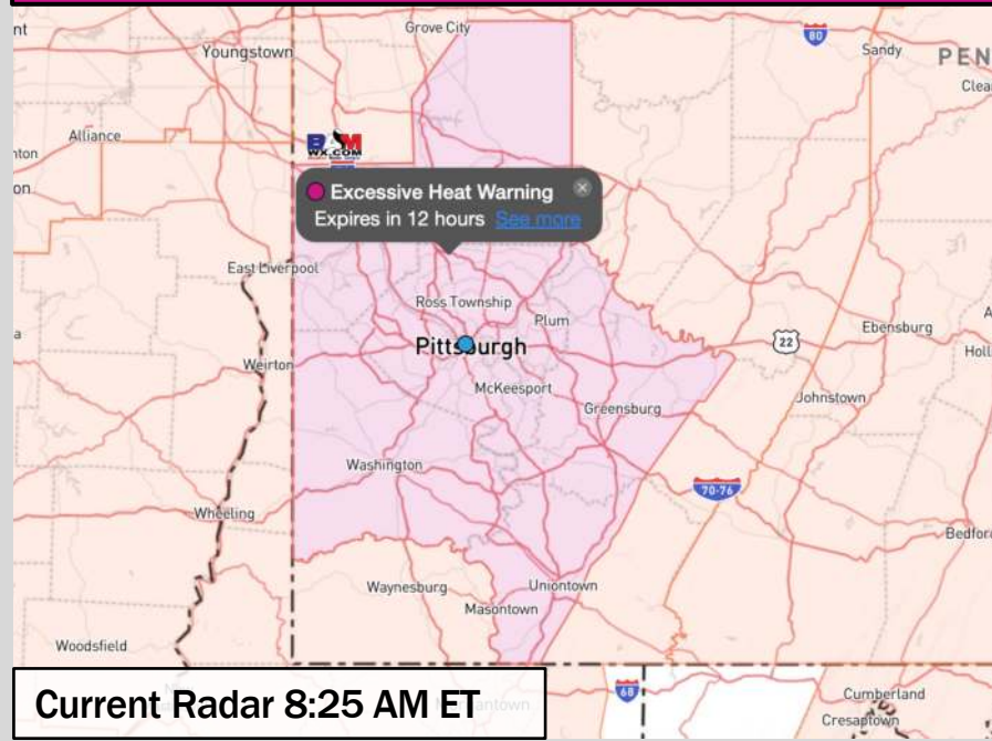
Current Radar 8:25 AM ET

Excessive Heat Warning (Ends SAT at 8:00 PM ET)