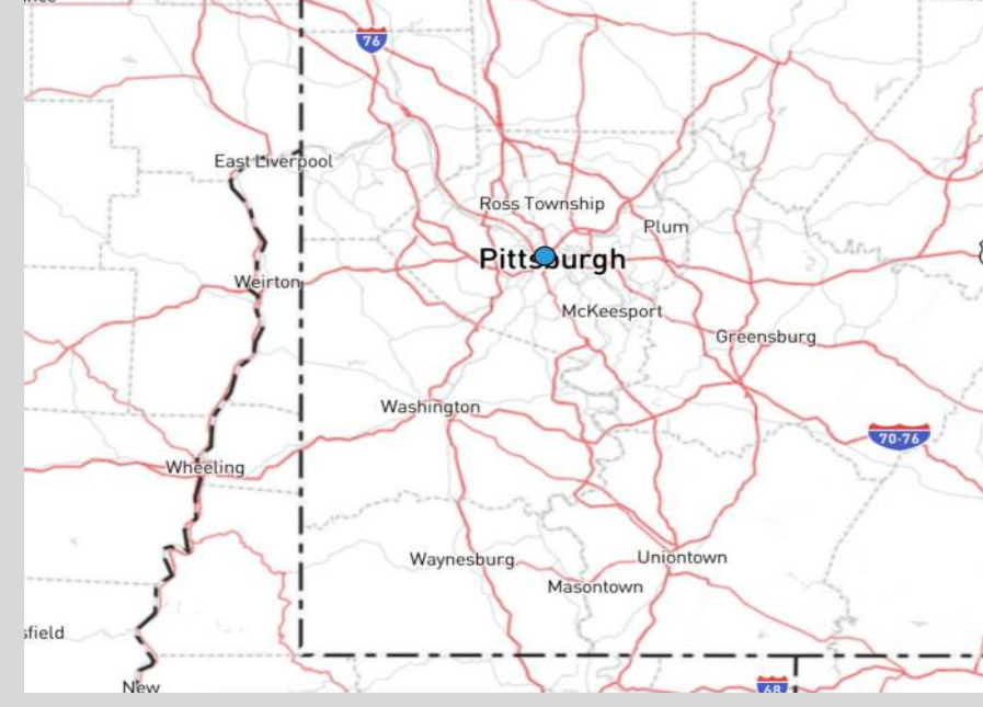
Current Radar 8:45 AM ET