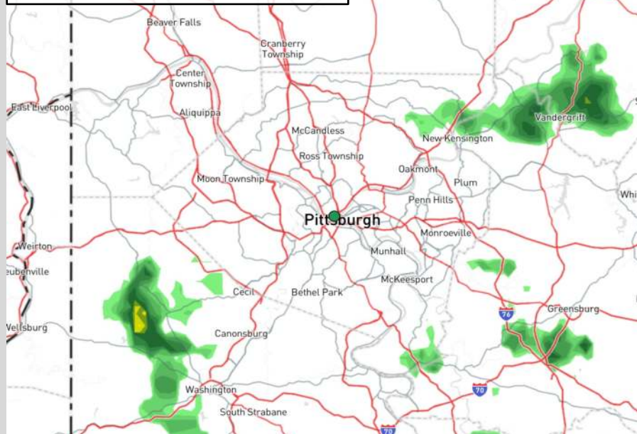
Current Radar 10:54 AM ET