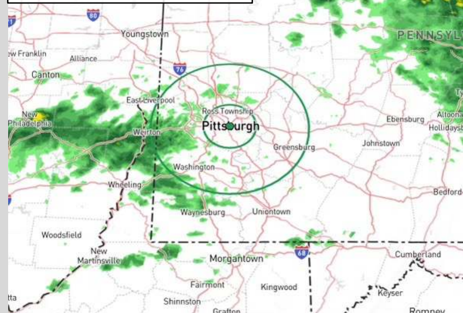
Current Radar 6:22 AM ET