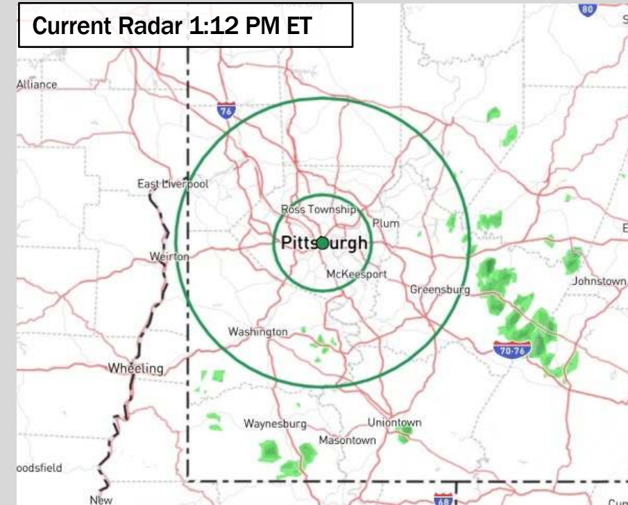
Current Radar 1:12 PM ET