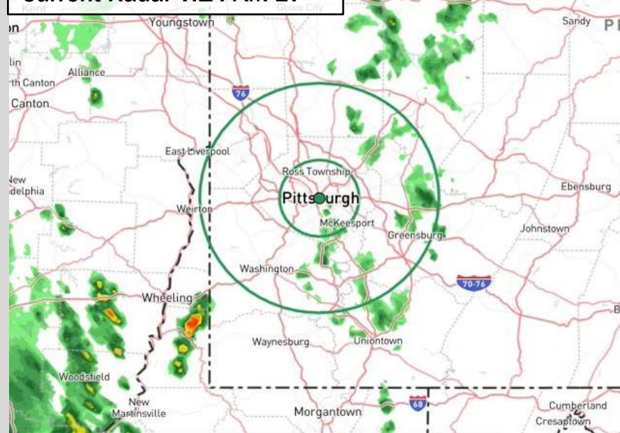
Current Radar 7:14 AM ET