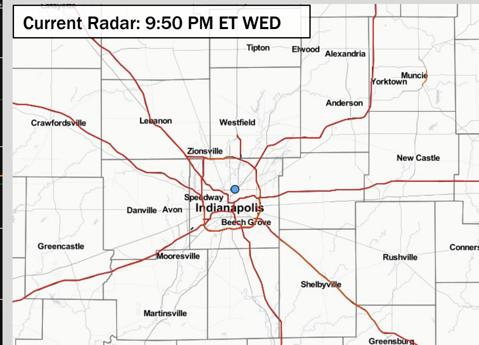
Current Radar: 9:50 PM ET WED