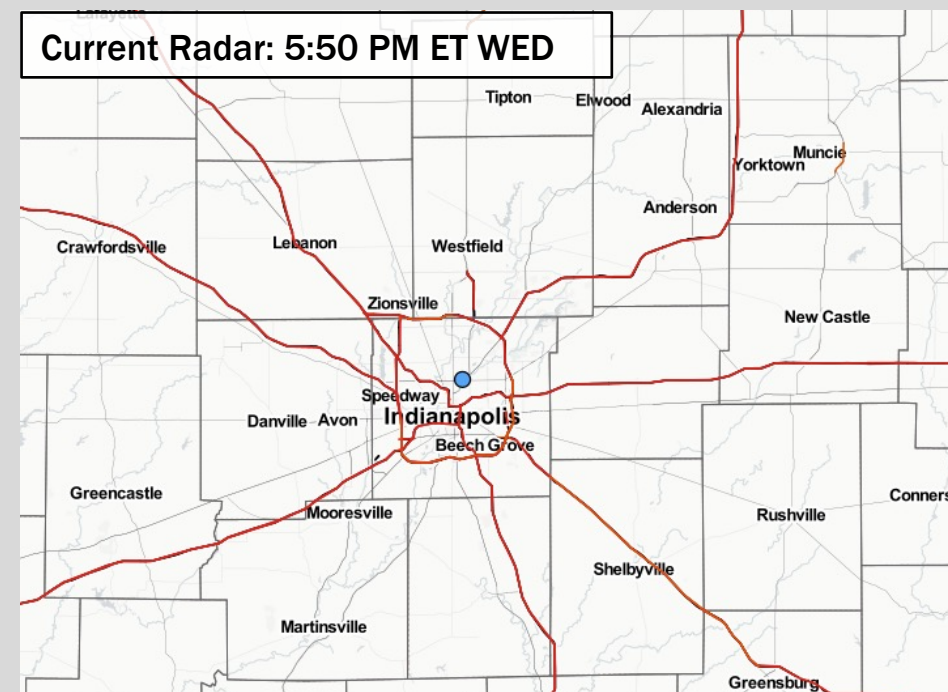
Current Radar: 5:50 PM ET WED