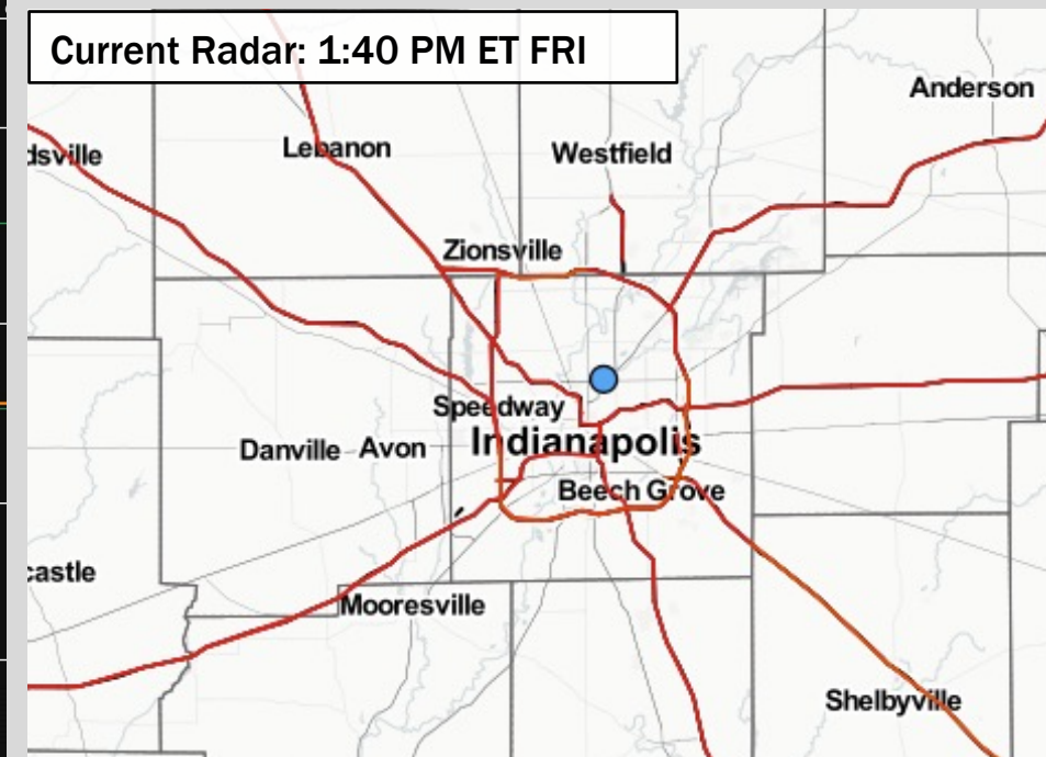
Current Radar: 1:40 PM ET FRI