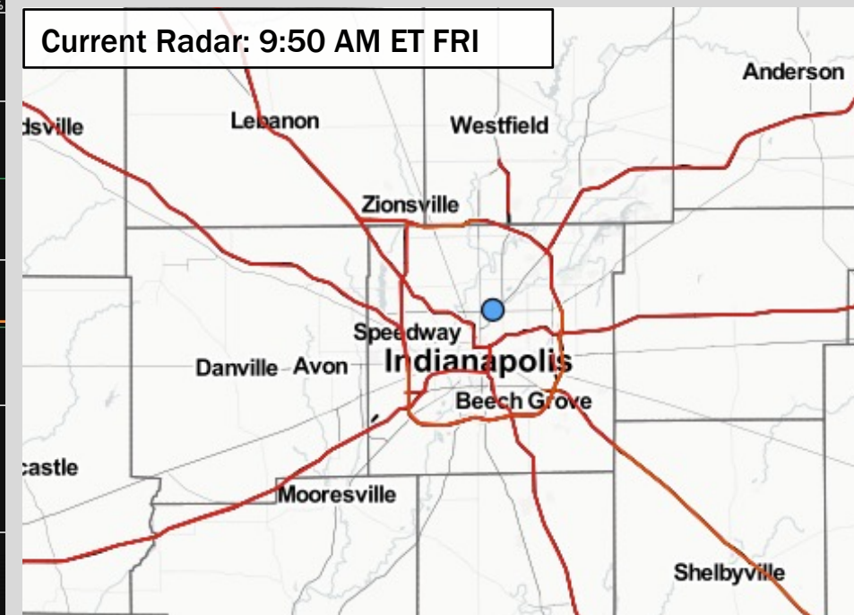
Current Radar: 9:50 AM ET FRI