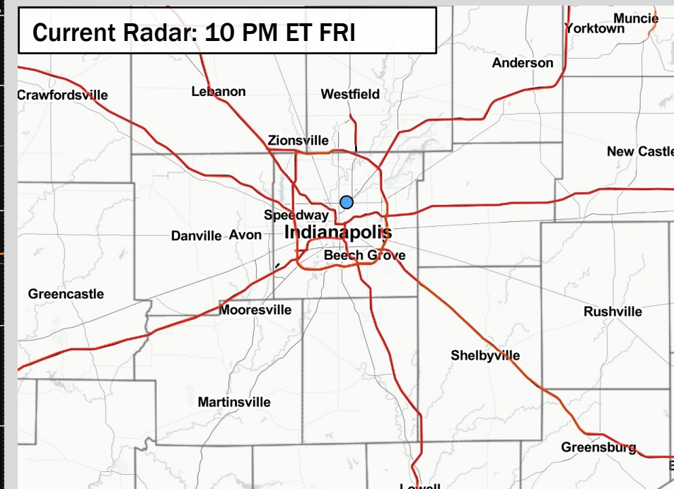
Current Radar: 10 PM ET FRI