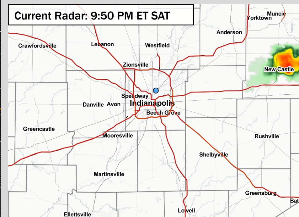
Current Radar: 9:50 PM ET SAT